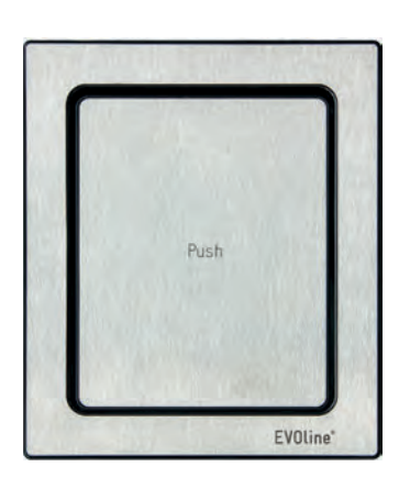
Brushed Stainless Steel