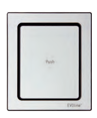
White Glass (frosted)