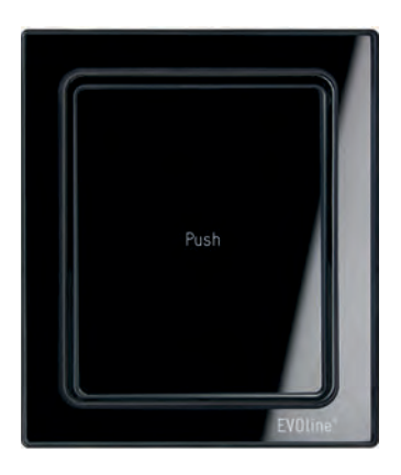
Black Glass (gloss)